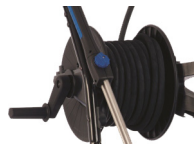
100' Hose Reel