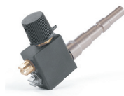
4" Super Short Lance