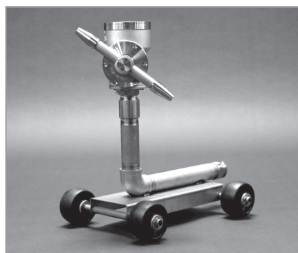
ScanJet SC15TW4 Trolley

AaquaTools water-driven products & solutions