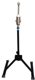
AquaClean+ Cabin Stand