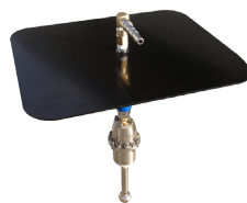
AquaClean+ Tank Cover

The cleaning efficiency of the AquaClean+ is achieved thanks to two or four stream jets at low flow rate but high pressure, thus providing high impact washing. Stream nozzles rotate around a turret to provide complete orbital cleaning coverage of all interior surfaces.